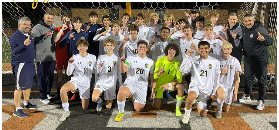
The Hornets won the SWBL East champions over Waynesville.